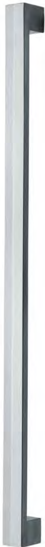
Entrance Pull Handle