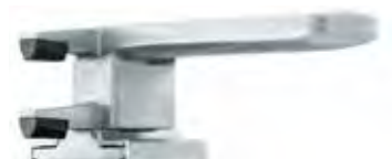
Non-marking lock tabs

Constructed from solid, 316 marine-grade stainless steel. Available in high profile (vented) or low profile options. Non-marking moulded nylon tips.