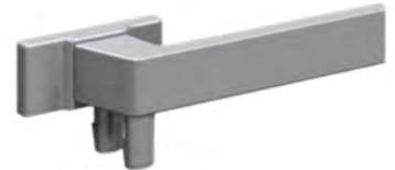
Window fastener Concealed fixing High profile - Venting