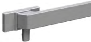
Window fastener Concealed fixing Low profile