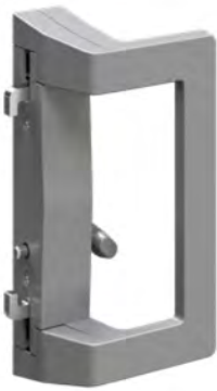
Patio sliding door lock