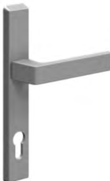
Hinged door hardware